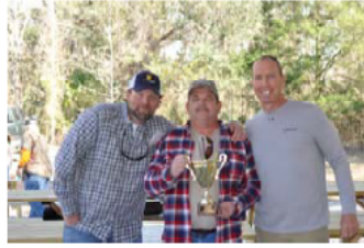
2018 1st Place Winners! WORLD ELECTRIC