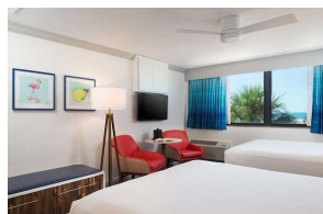
Beachfront Traditional 2 Bed Queen

Please note: Guests staying Saturday night will be responsible for the $15.00 per night Parking & WIFI fee OR the $25.00 per night Amenity fee in addition to the 13% room tax.