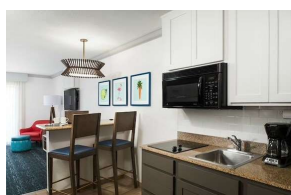
Premium Queen Studio with Kitchen & Balcony